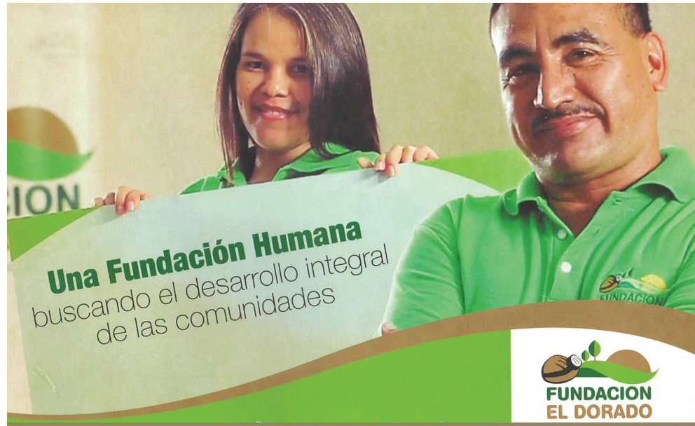
Cover El Dorado Foundation brochure

Not only are these activities designed to enhance the reputation of the company, but they may also be intended to neutralize its critics.