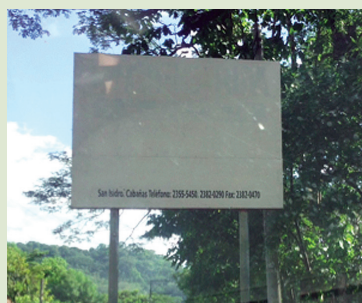
Blank billboard after Pacific Rim was acquired by OceanaGold.