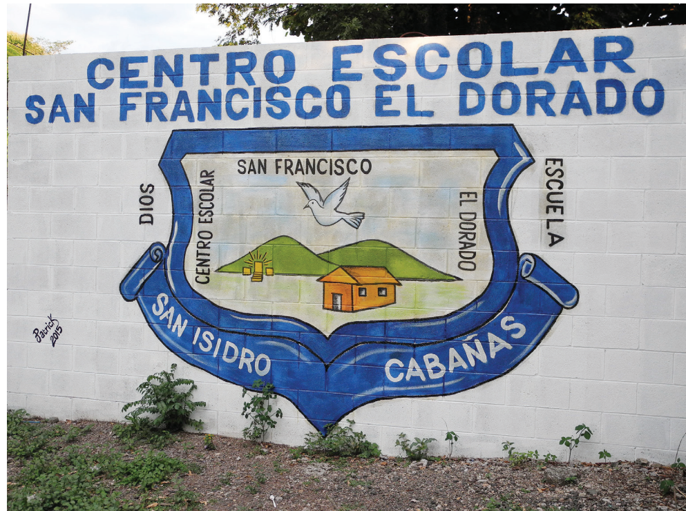
School wall San Isidro, Cabañas.

a list of potential employees, thus generating expectations that they will eventually receive jobs with the company. 40 More importantly, these future employment opportunities are being presented as contingent on a resolution in the ICSID case that favors the mining company, i.e., a decision that compels the Salvadoran government to reverse its promise not to issue new mining permits. This information is misleading, since ICSID cannot force the government to change its laws, policies, and practices with regard to mining. Furthermore, whatever decision ICSID makes, one of the parties is likely to seek its