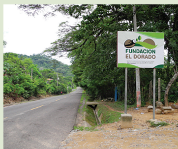
Fundación El Dorado billboard.