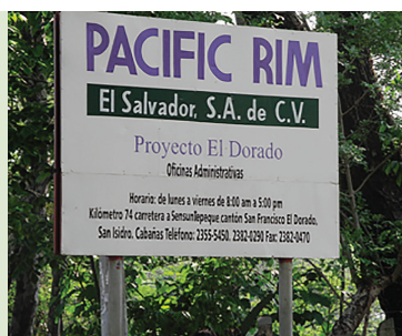
Pacific Rim Billboard in front of company gate in San Isidro, Cabañas.