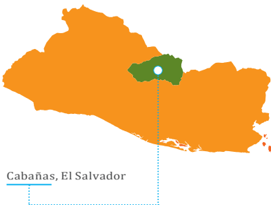
Cabañas, El Salvador