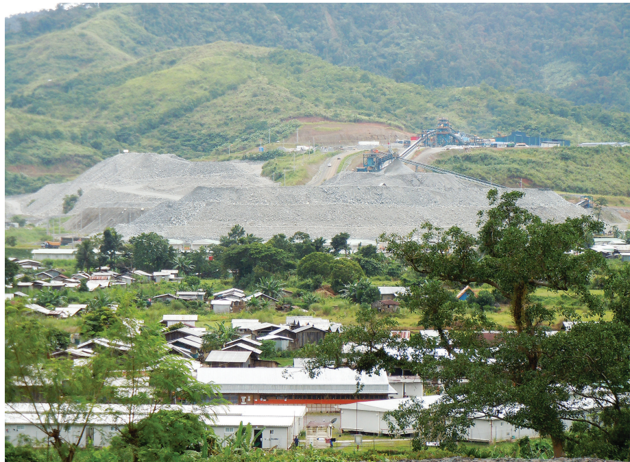
OceanaGold’s Didipio open-pit copper and gold mine in the Philippines.

“OceanaGold is strongly committed to nearby communities through focused programs, principally in holistic education, health, environmental improvement, the promotion of a culture of peace and promotion of entrepreneurship.” 22