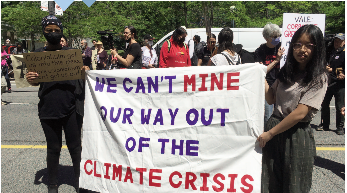
Protest at the 2022 Prospectors and Developers Association (PDAC) convention in Toronto.