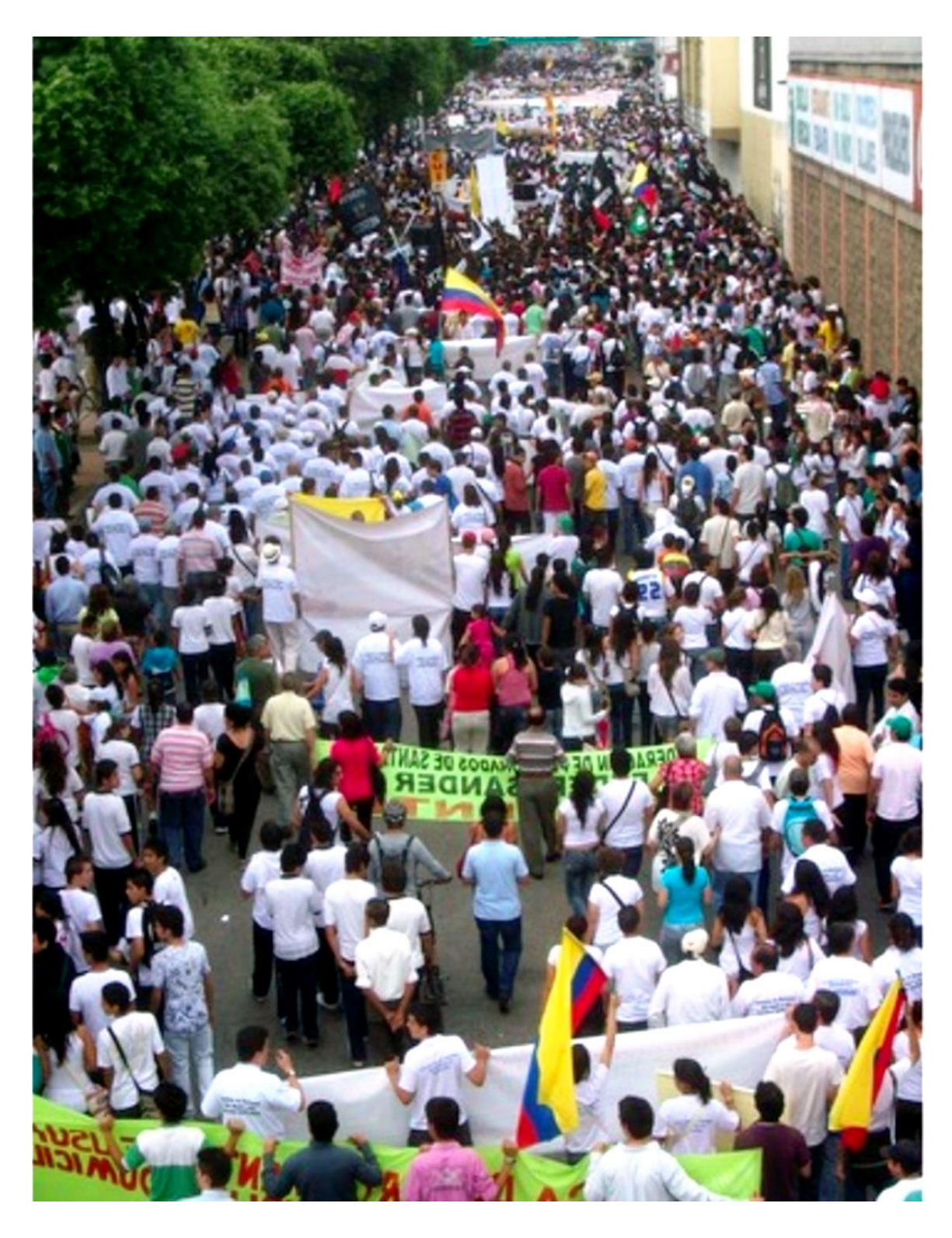
9. Resisting mining in Colombia.