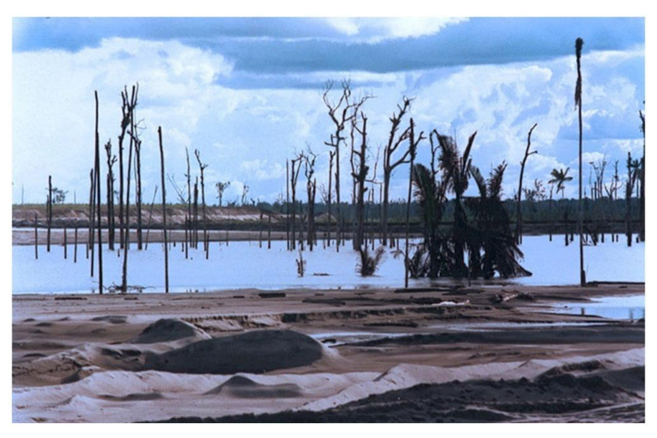
4. This was once a luxuriant tropical forest, now poisoned by mine wastes.