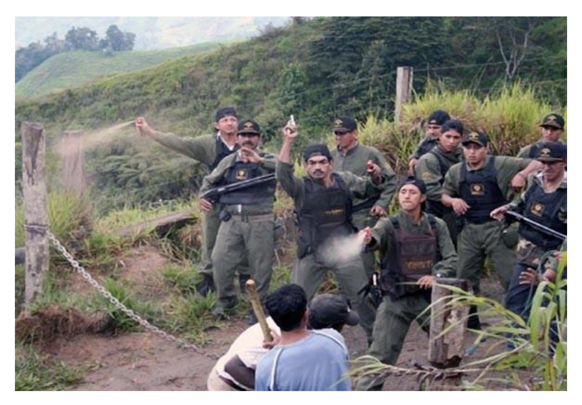
7. Police attacking mining resisters at Intag, Ecuador