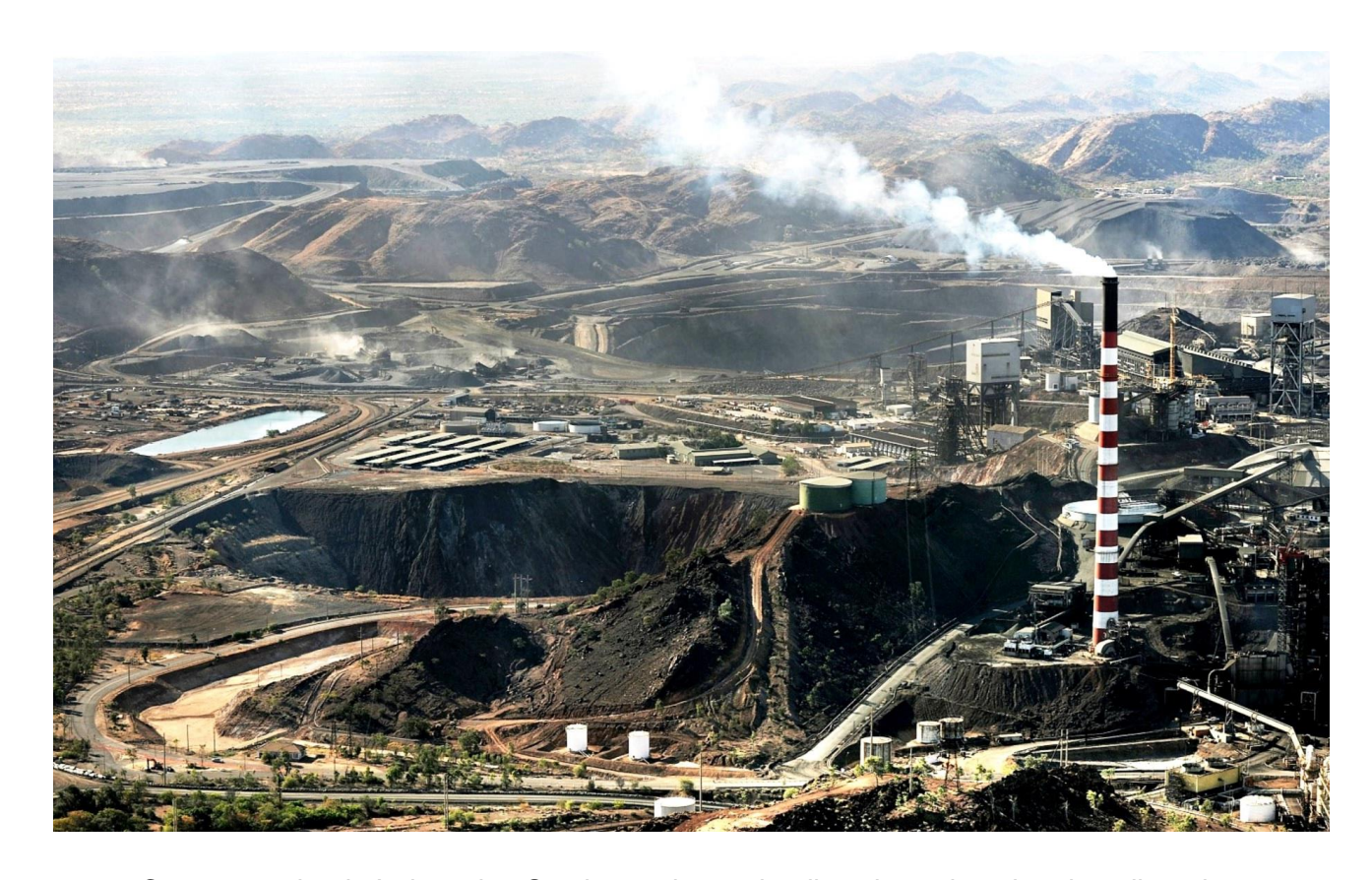
3. Copper smelter in Indonesia. Smelters release deadly poisons into the air, soil, and water.