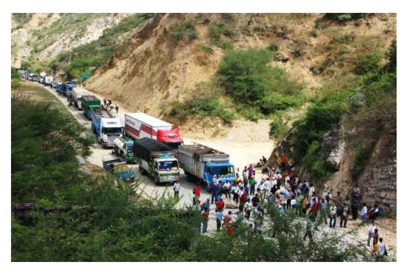
8. Indigenous people resisting mining operations in the Amazon, Peru