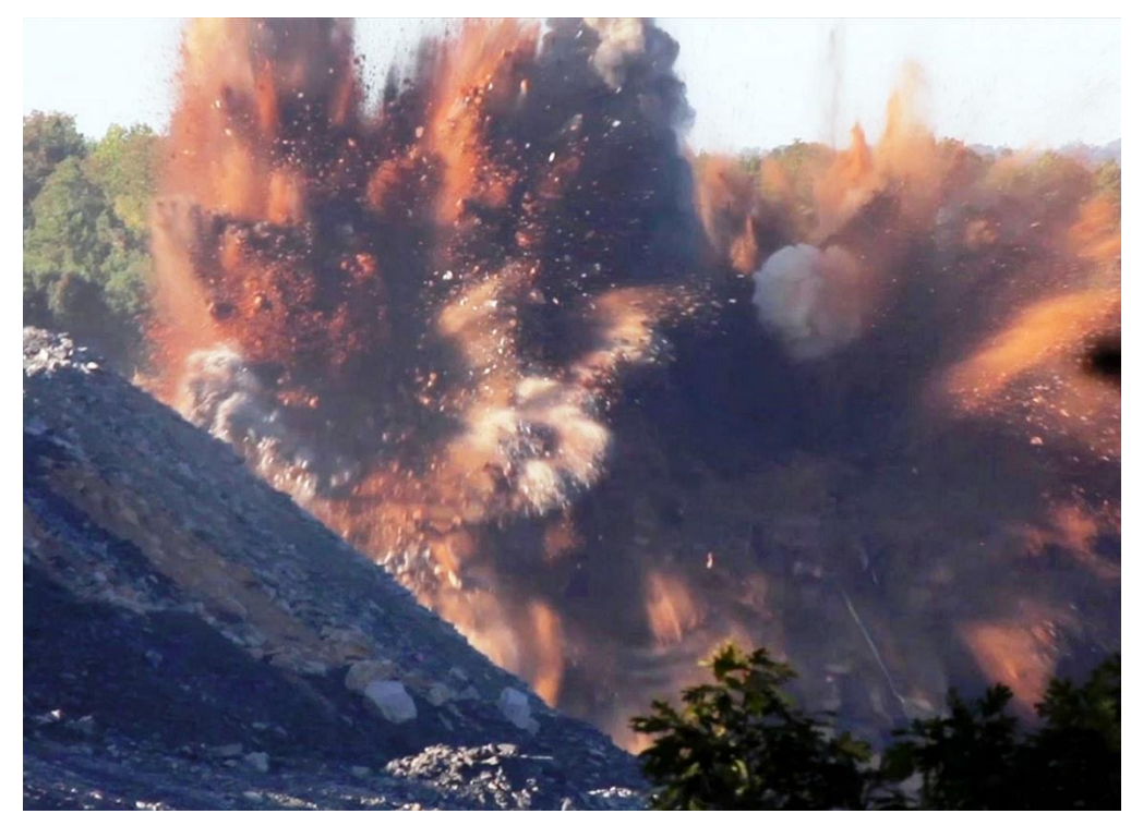
2. Strip mining using explosives, another source of contamination. Millions of kg of explosives yearly are sometimes used. (Photo: Alabama, U.S.)