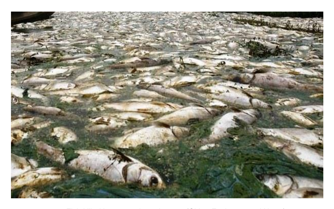
5. Fish killed by contaminated water.