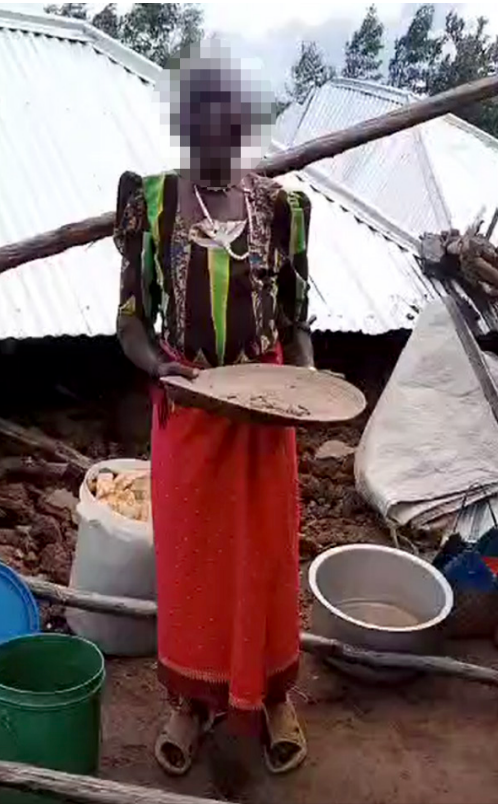
Photos left to right: Houses bulldozed in Komarera Village. December 2022; Elderly woman surrounded by her family's bulldozed houses. September 2023.

An 80-year-old female caretaker for five school-aged grandchildren said, "[a]fter the demolition I did not have a place to go, I've been moving from place to place. So far I have moved to three places already. The children are not going to school. Now we lack food, because the place I was growing food is destroyed. We are suffering a lot to get food. The small one now has malnutrition."