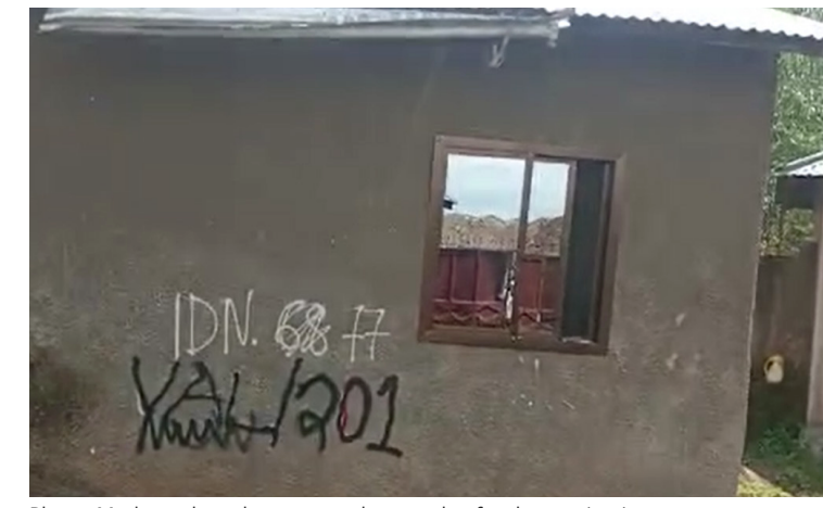
Photo: Marks such as those put on houses due for destruction in Komarera and Kewanja. 2022.

Those who were at the May 2020 meeting, or heard about the meeting from others, reported that they were told that the mine wanted the land for mining purposes and that they should no longer harvest or plant or build on their land. This message, warning people to stop "developing" their land, was heard by various villagers at different times starting in 2020, either through rumours, or at the time their land was entered and identification numbers were put on their houses.