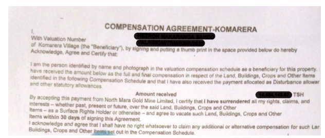
Photo: Section of legal waiver that must be signed in order to receive compensation.

The Ministry of Lands report notes that the assessors "invented some two other forms, which are not statute bound, that [sic] helped us in the exercise." One of these was "special forms [sic] for agreement with the PAPs [Project Affected Persons]."<sup>35</sup> It is possible this special form was the waiver. This waiver violates human rights norms, as detailed in Section Two below, which require that legal remedies be provided and even supported through legal aid for those affected by eviction, rather than restricted through legal waivers.<sup>36</sup>