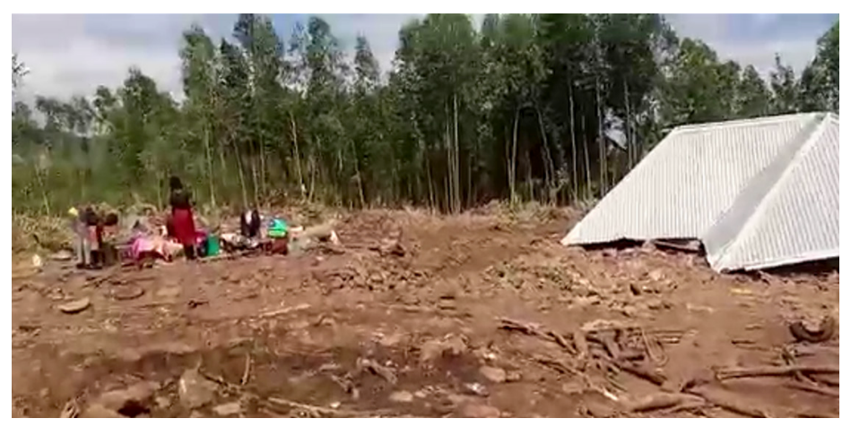
Photo: Family with belongings after the bulldozing of their house. December 2022. (Still from video with MiningWatch Canada)