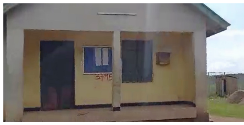
Photo: Komarera Village office, where villagers came to find out what their compensation would be. Now just outside the fenced off area. November 2023.

A mother of eight children said, "I started to have health issues soon after I went to the village office to see how much they are going to pay me. When I saw my payment I started sweating and shaking and experienced weakness. I was taken to the hospital and was admitted one week. They told me my blood pressure is very high. I became so depressed."