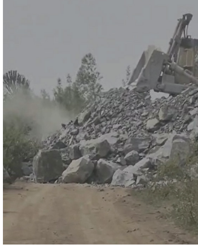
Photos left to right: Waste rock from construction of new Gena Pit. 2023; Former road in Komarera Village being covered by waste rock. 2023. (Stills from videos with MiningWatch Canada)