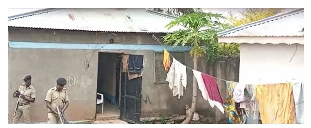
Photo: Police overseeing the bulldozing of houses in Komarera Village. December 2022.

In MiningWatch's report of 2022, and in this report, we describe how each stage of the eviction process was accompanied by police presence, often Field Force Units. We documented cases in which villagers experienced physical violence by police, threats of detention, as well as arbitrary detention.<sup>64</sup>