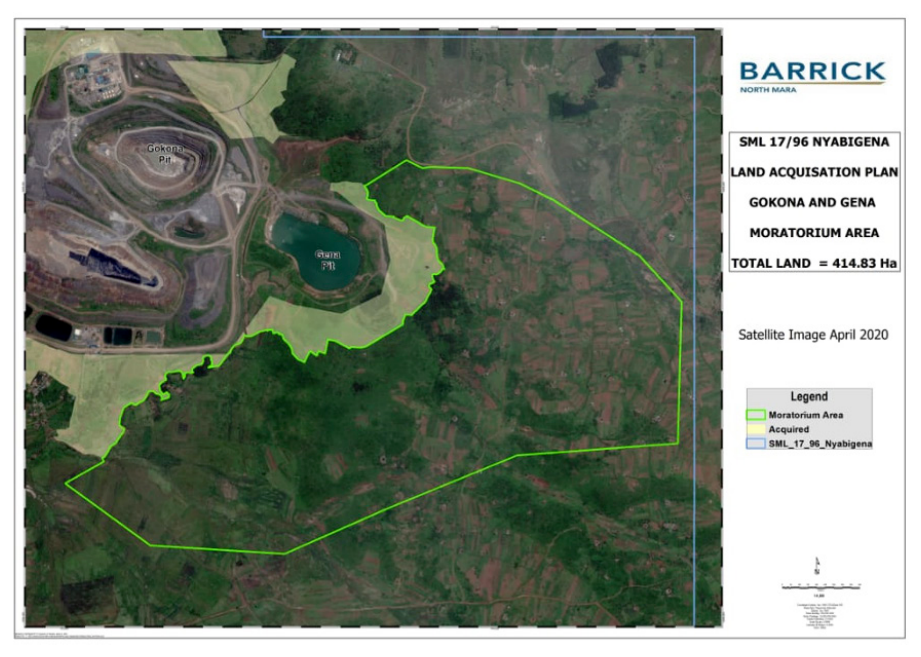
Outline of sections of Komarera and Kewanja Villages to be cleared of habitants.