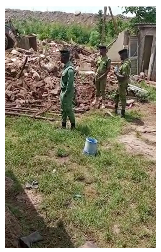
Photo: Police overseeing bulldozing of houses in Komarera Village. December 2022.