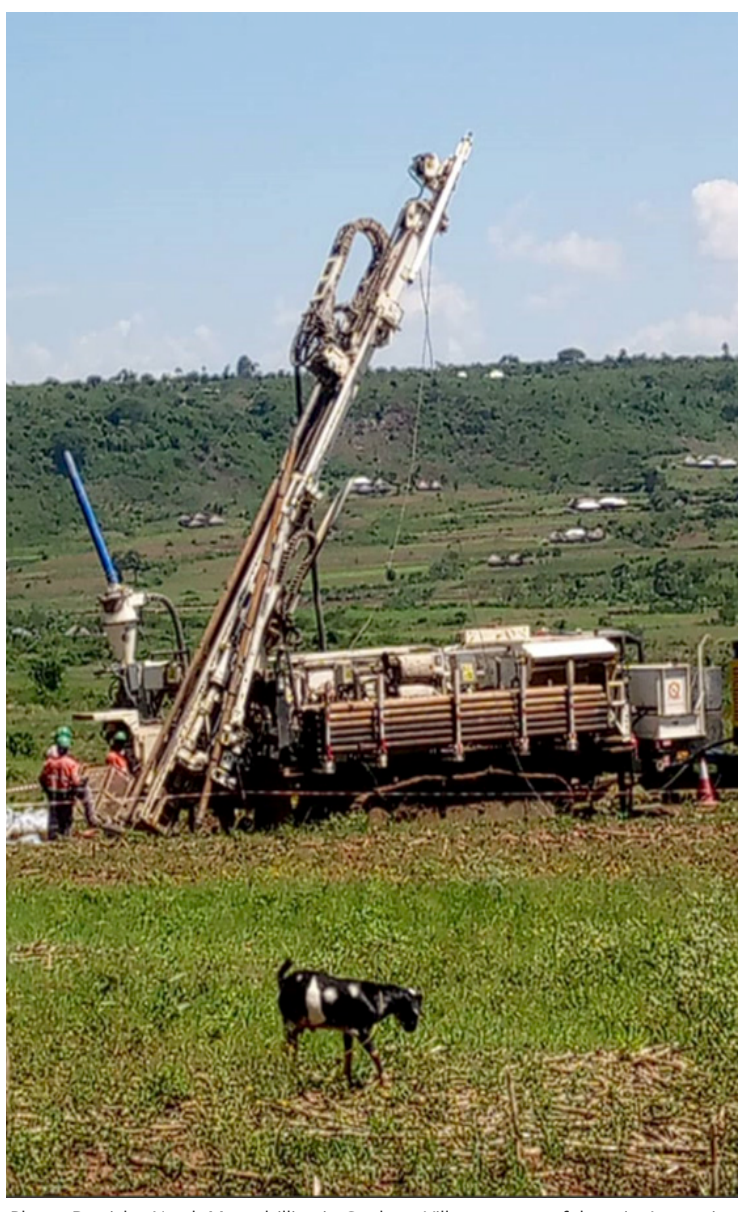
Photo: Barrick – North Mara drilling in Genkuru Village as part of the mine's ongoing exploration." November 2023. (MiningWatch Canada)

Unless human rights norms are applied, the pattern of abusive eviction processes is set to continue as Barrick maintains an active drilling program around the existing operations. MiningWatch spoke to a woman who owns agricultural land in Nyaiheto hamlet in Kewanja Village.<sup>111</sup> Agricultural land in that area was evaluated between March and May of 2022. Neighbouring areas in Komarera North and Nyakunguru Village were also evaluated between 2020 and 2022. When her land was evaluated she was told not to harvest from, or cultivate, the land anymore. That land had provided funds for her children's school fees. In the year and a half since the evaluation was done, there was no further move to compensate the people. In November 2023, a public notice was issued to say that the mine would no longer require these areas and the prohibition on their use was lifted. No mention was made of compensation for the losses people endured in the years that they could not use their land for food security and income.<sup>112</sup>