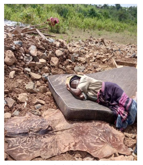
Photo: Woman rests after her house was bulldozed. December 2022.

A mother of 10 children said, "[w]e did not stay to watch the house get demolished. My husband ran away. He said he was going to commit suicide. I cried a lot. It was not easy to see my house get demolished. I was thinking, 'where can we get the money to build a house?' I am a person with a family. I had only that one house to live in."