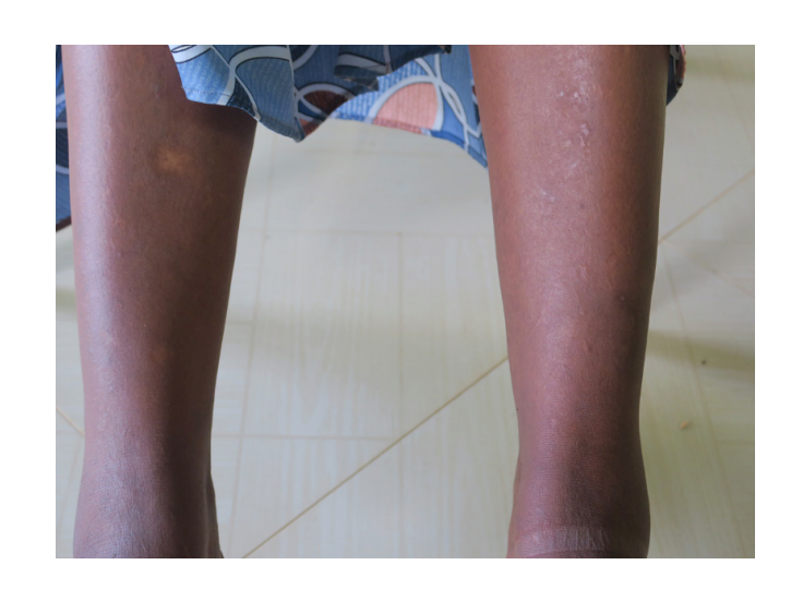
Photo: Scars on woman's legs from beating by police after she started wailing when she discovered her house had been bulldozed. 2023.

A woman with 16 people in her household said, "[t]hey demolish and leave you there. They don't care where you will get shelter. They said if I don't leave they will demolish the house with me inside it."