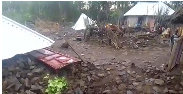
Photos: Partially destroyed property. December 2022. (Stills from videos with MiningWatch Canada)