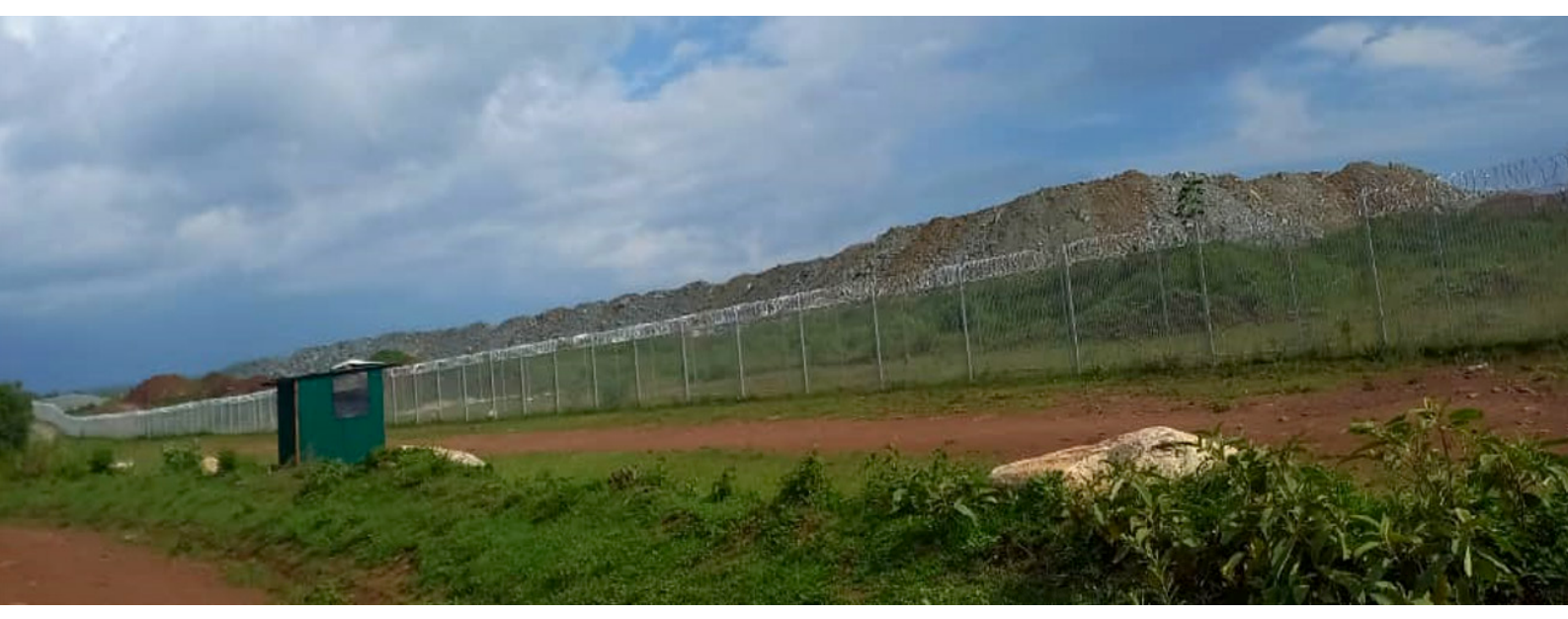
Photo: New fence and guard posts around cleared land and new pit construction. November 2023. MiningWatch Canada

When MiningWatch asked what remedy they would want to receive for the losses they had suffered through being forcibly evicted, all responded that they just wanted to have back the life they had before: their land, their houses, their crops. They also emphasized the urgent need to have land and houses to be able to reunite their families, which had become scattered after their homes and lands were bulldozed.