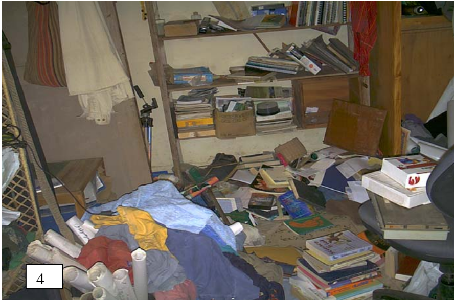
4. habitación de Carlos Zorrilla después del allanamiento ilegal.