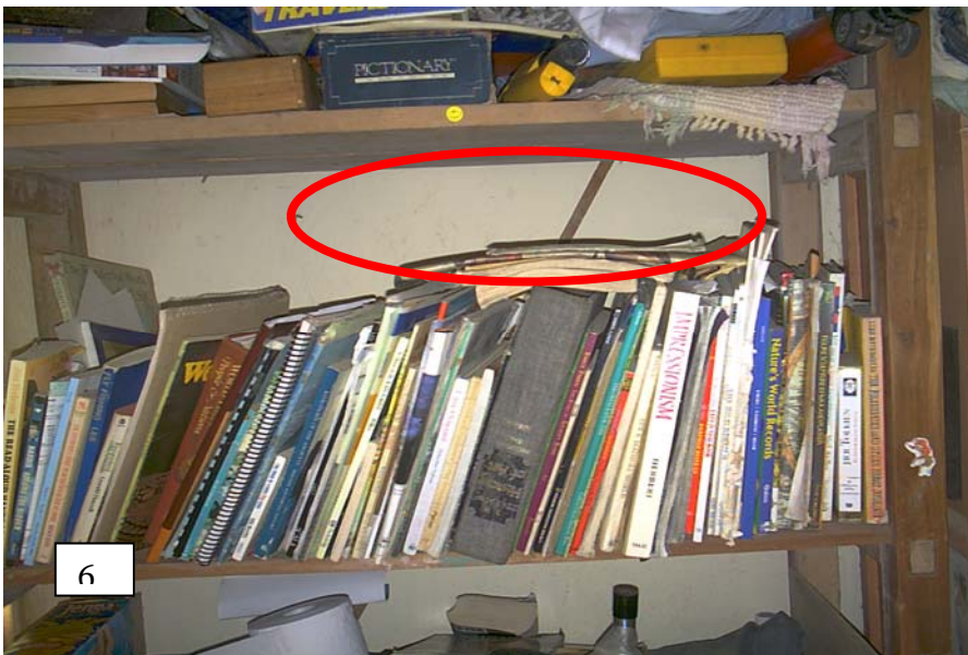
6. Habitación del hijo de Carlos Zorrilla, lugar donde se colocó un arma de fuego. Una vez más para inculpar a Zorrilla.