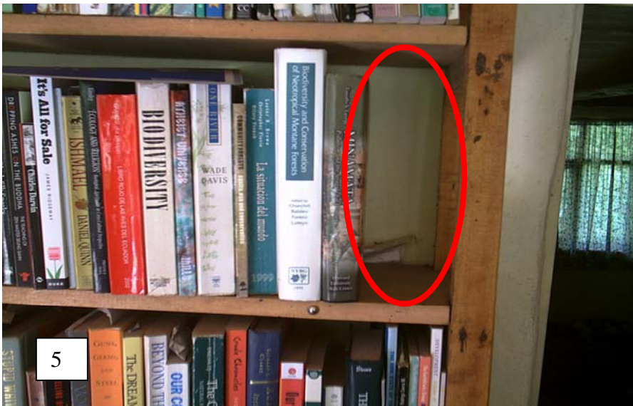
5. lugar en el que fue colocada la funda con supuesta droga, para inculpar a Carlos Zorrilla.