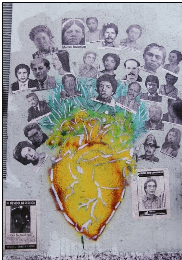
Memorial for victims of the Guatemalan genocide, Guatemala City, May 2018.

The mine was initially developed in 2002 by the Nevada-based company Glamis Gold through its Guatemalan subsidiary Montana Exploradora de Guatemala SA ("Montana"). 27 In 2006, Goldcorp, a Canadian company headquartered in Vancouver, British Columbia, acquired Glamis in a $8.6 billion deal. 28 In 2019, Goldcorp was acquired by Newmont Corporation, an American company based in Colorado. 29