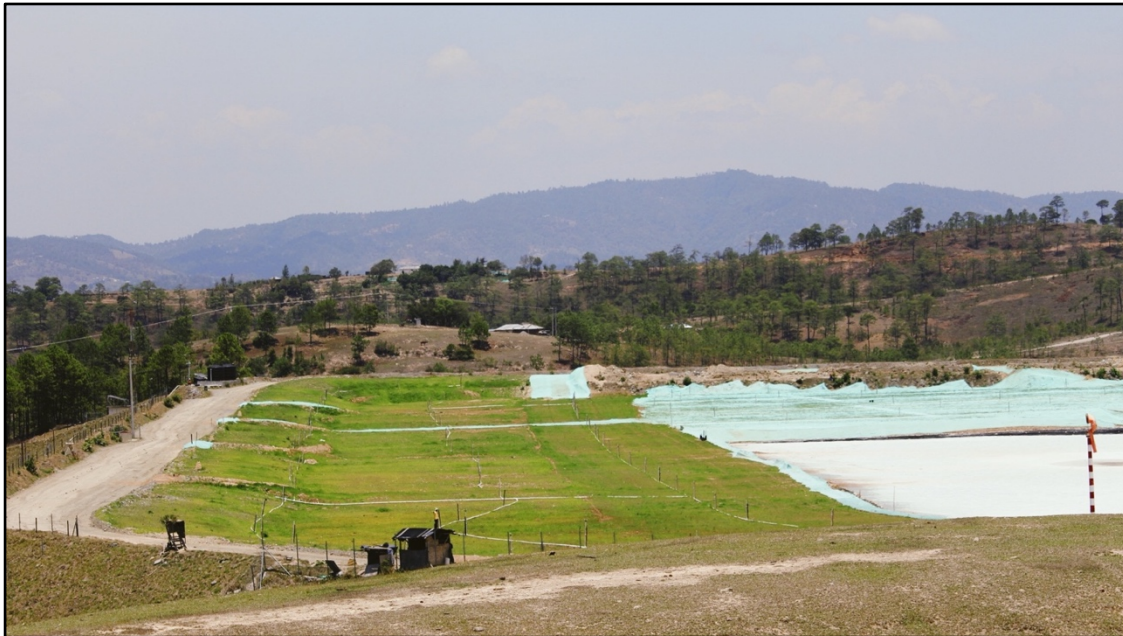
The tailings pond at the Marlin Mine during reclamation, May 2018.

groups reported that only 24 of a total of 42 recommendations in the 2010 Human Rights Assessment commissioned by Goldcorp had been fulfilled completely. 267 At the time of writing, more than 14 years after the petition was first filed, the IACHR has yet to pronounce on the merits of the case, and Guatemala has yet to comply with the IACHR precautionary measures, first issued in 2010 and amended in 2011. 268