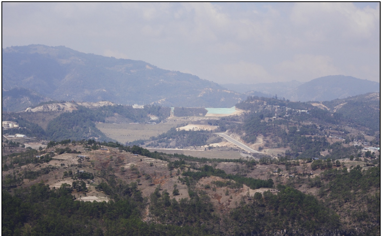
The Marlin Mine straddles the municipalities of San Miguel Ixtahuacán and Sipacapa in the Department of San Marcos, located in the northwestern highlands of Guatemala.

This part presents an account of how, almost immediately after the IACHR precautionary measures order was issued in May 2010, Canada undertook a multifaceted lobbying strategy that aimed to influence both the Government of Guatemala and the IACHR in order to promote Goldcorp’s interests and secure a favourable outcome for the company. This account is based on government records collected and analyzed pursuant to the methodology described in this report’s introduction. We find that these actions were inconsistent with Canada’s obligations outlined in the previous section. Neither Canada nor Goldcorp were parties to the proceedings between the Indigenous petitioners and the Government of Guatemala, and so any application of pressure by Canada on behalf of Goldcorp in the context of the IACHR process was inappropriate. The following sections are organized according to the four obligations set out above. Each section begins with a narration of the relevant facts of Canada’s response to the precautionary measures, followed by an analysis of Canada’s failure to uphold each obligation.