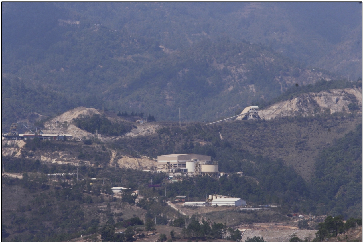
The Marlin Mine processing plant, May 2018.

We conclude that, on the whole, Canada's actions undermined the rule of law and the inter-American human rights system. Goldcorp's congratulatory note to Canadian Permanent Representative to OAS regarding the lifting of suspension underscore that the two shared a common purpose. Ultimately, Canada and Goldcorp's coordinated action in defense of the company's commercial interests undermined the efforts of affected Indigenous communities to defend their rights and access justice.