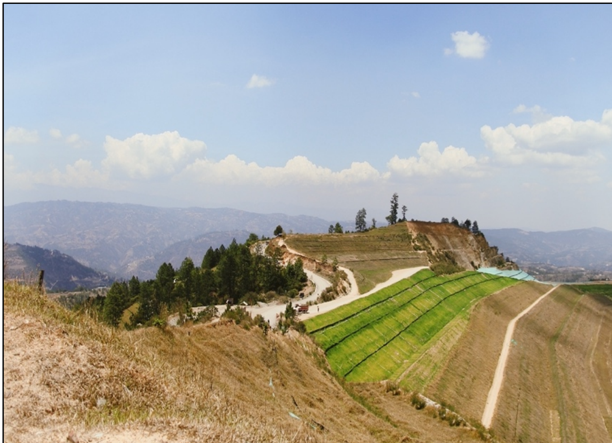
A portion of the Marlin Mine's open-pit, atop a mountainside in San Miguel Ixtahuacán, May 2018.

detected high downstream concentrations of iron, aluminum, manganese, and arsenic that exceeded national and international water use standards. 79 There were also first-hand reports of health problems such as skin infections, and livestock deaths, believed to be caused by contaminated waterways and heavy metal-infused dust. 80