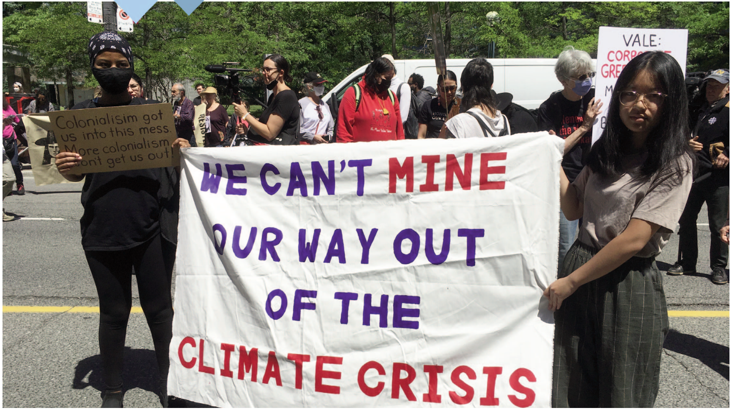
Protest at the 2022 Prospectors and Developers Association (PDAC) convention in Toronto.