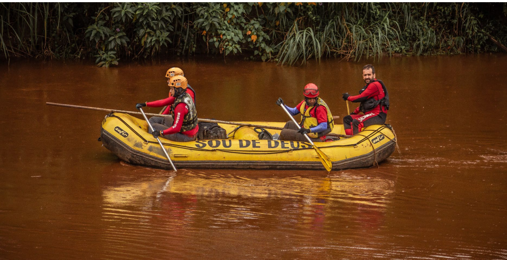
Contamination of the Paraopeba River after the 2019 tailings dam collapse near Brumadinho, Brazil.

Worst-case tailings failure scenarios must be modeled and made public prior to permitting and regularly updated throughout the facility lifecycles. Worst-case scenarios must model the complete loss of stored tailings and water, as occurred, for example, in the failure of the tailings dam at the Córrego do Feijão Mine in Brazil. Emergency and evacuation drills related to catastrophic failure of tailings facilities must be held on an annual basis, and its planning and execution should include participation from affected communities, workers, local authorities and emergency management. The operating company must report to stakeholders on tailings facility management actions, monitoring and surveillance results, independent reviews and the effectiveness of management strategies.